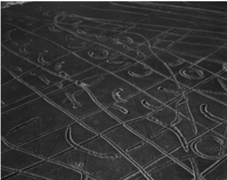
Sophie Ristelhueber, Fait #14 , ( http://www.sophie-ristelhueber.fr )

Judith Butler relates grief to dispossession, becoming undone, and being beside oneself . 5 In the exhibition Gulalhi , Shield evoked a territory made up of shifting, elusive patterns, reflecting the photographic landscapes in the space and suggesting the wounding of people and land simultaneously.