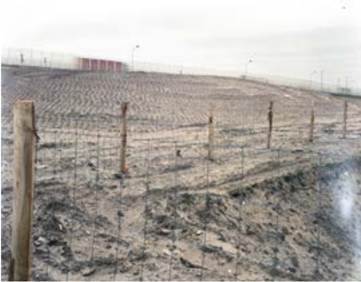
Sophie Ristelhueber, Old Jungle , 2018. Archival inkjet print on Dibond, 20.5×26 in.

I cried when he told me his friend in Afghanistan was killed. He had been telling him to leave the army, but he couldn't find another job.