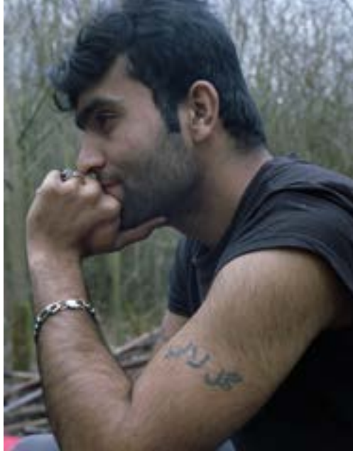
Stephanie Gervais, Aziz , 2018. Archival inkjet print on Dibond. 26×20.5in.

In Afghan performance artist Lida Abdul's film In Transit (2008), made outside of Kabul, a group of children play with a decomposing Russian plane abandoned during the Soviet occupation of Afghanistan. The plane's metal façade is splattered with bullet holes—wounds—that the children fill with bunches of cotton. Watching the film, we know that the plane will never fly again, but we also think about the metal sheeting that once served as protection for whoever was inside.