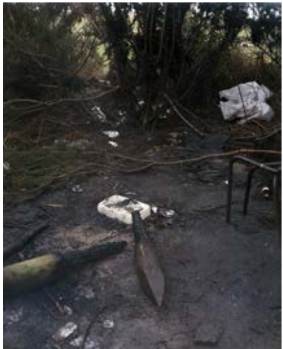
Stephanie Gervais, Campsite burnt by the police , 2018. Archival inkjet print on Dibond, 26×20,5 in.

“All of Afghanistan is blood. Many people don’t have arms or legs.” We are constantly looking at images of blood, bodies wrapped in white cloth. How can we speak about trauma when your entire upbringing, history, the things you have done and the ways you have moved through space, are all inseparable from violence? 9