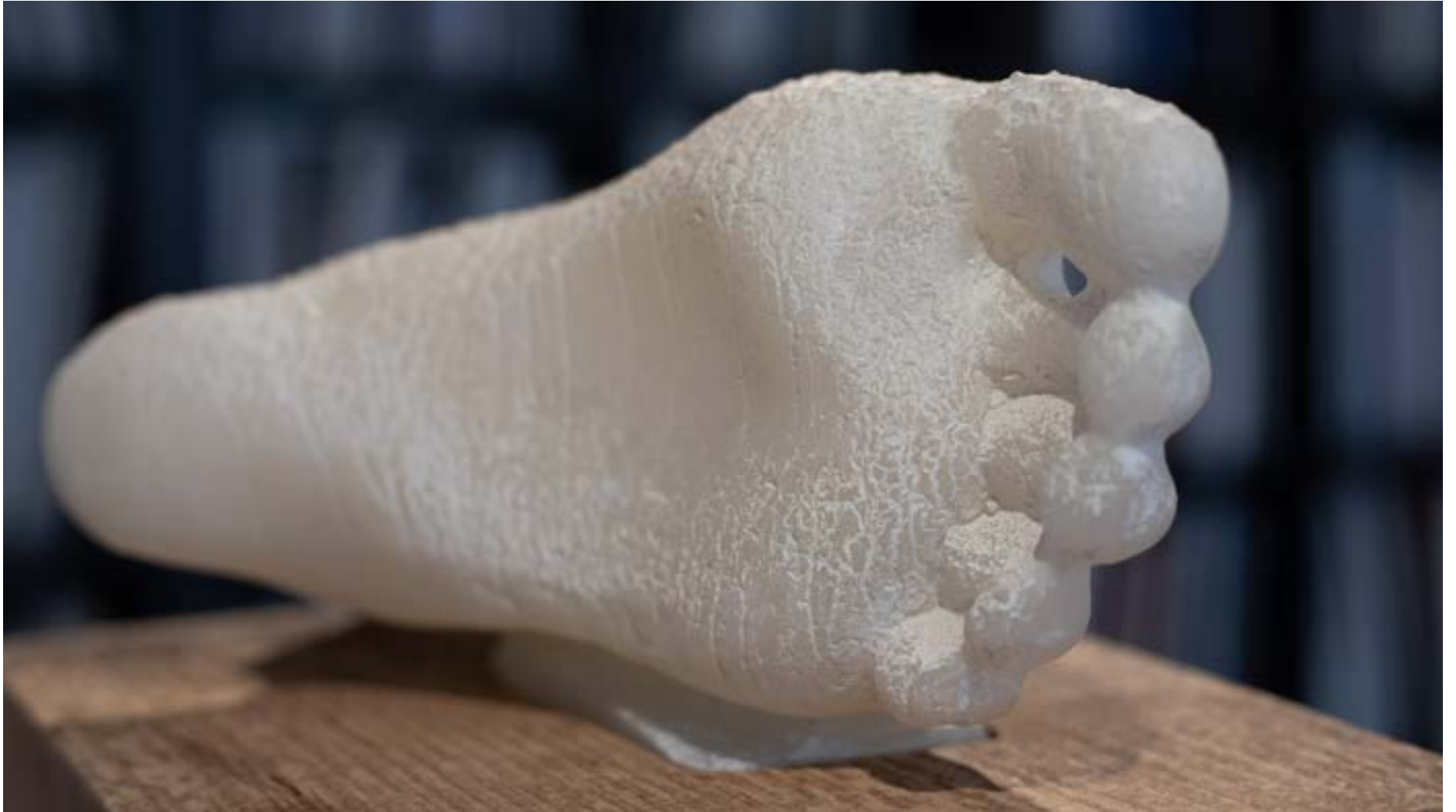
Malia Jensen, Foot (detail) , 2020. Kiln-cast glass, etching ink, white oak and fir base, 8×13,5×11,5 in.