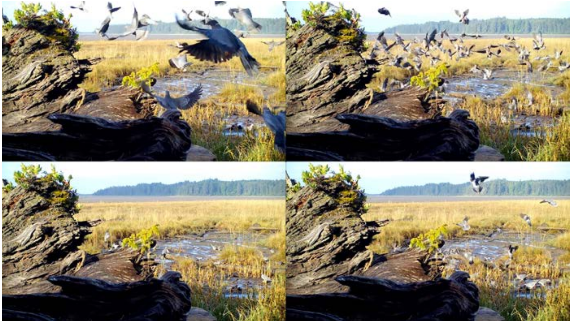
Malia Jensen, Worth Your Salt , 2021. Video still, Nehalem Estuary camera location