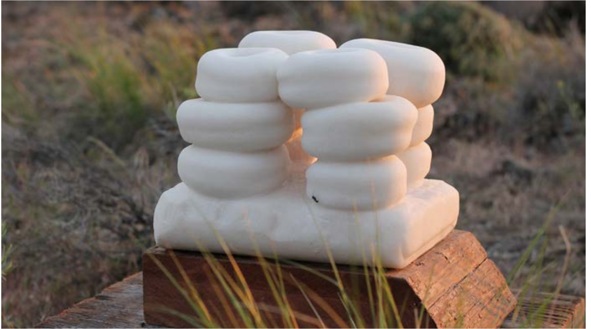
Malia Jensen, Nearer Nature , 2019. Carved salt sculpture, Donuts, installation view, Sisters, Oregon